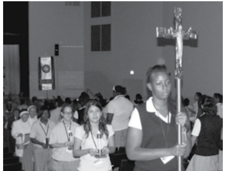
Maria High School opening liturgy and missioning.