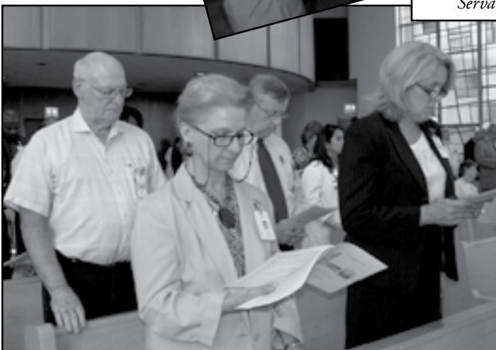
Holy Cross Hospital Leadership