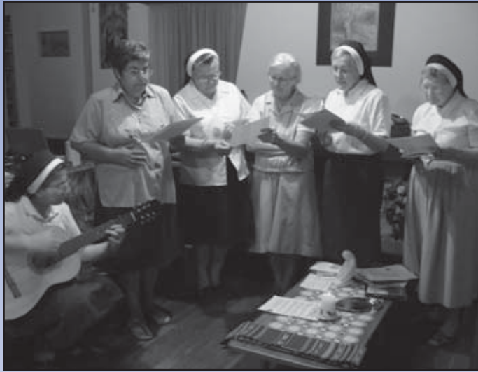
We prayed together often during our time together which was also filled with meetings and discussions.