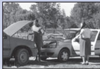
Some drives took longer than others.

had excellent drivers, I was not always the most relaxed passenger in the very different rules of the road in Argentina. I was always happy to get to our destination safely!