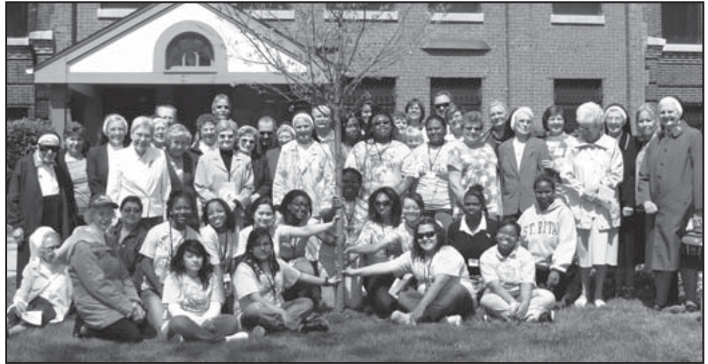
Sisters of St. Casimir, SSC employees, and representatives from Holy Cross Hospital and Maria High School – including the school's Environmental Club, were among those on hand for the Earth Day prayer service and tree planting held on April 22, 2010, at the SSC Motherhouse.