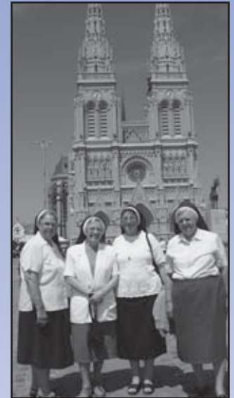
Here we are at the Shrine of Our Lady of Lujan.

Most of the time I was hoping that all these wonderful experiences were within walking distance, but they were not. They were usually a “long drive” away and, though we always