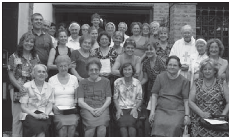
Sisters of St. Casimir Argentine Associates gather in Avellaneda, Argentina on February 6, 2010 for their annual commitment ceremony.